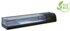
SUSHI CASE 145