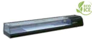
SUSHI CASE 180