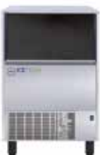
673 x 557 x 984** mm