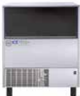
843 x 557 x 984** mm